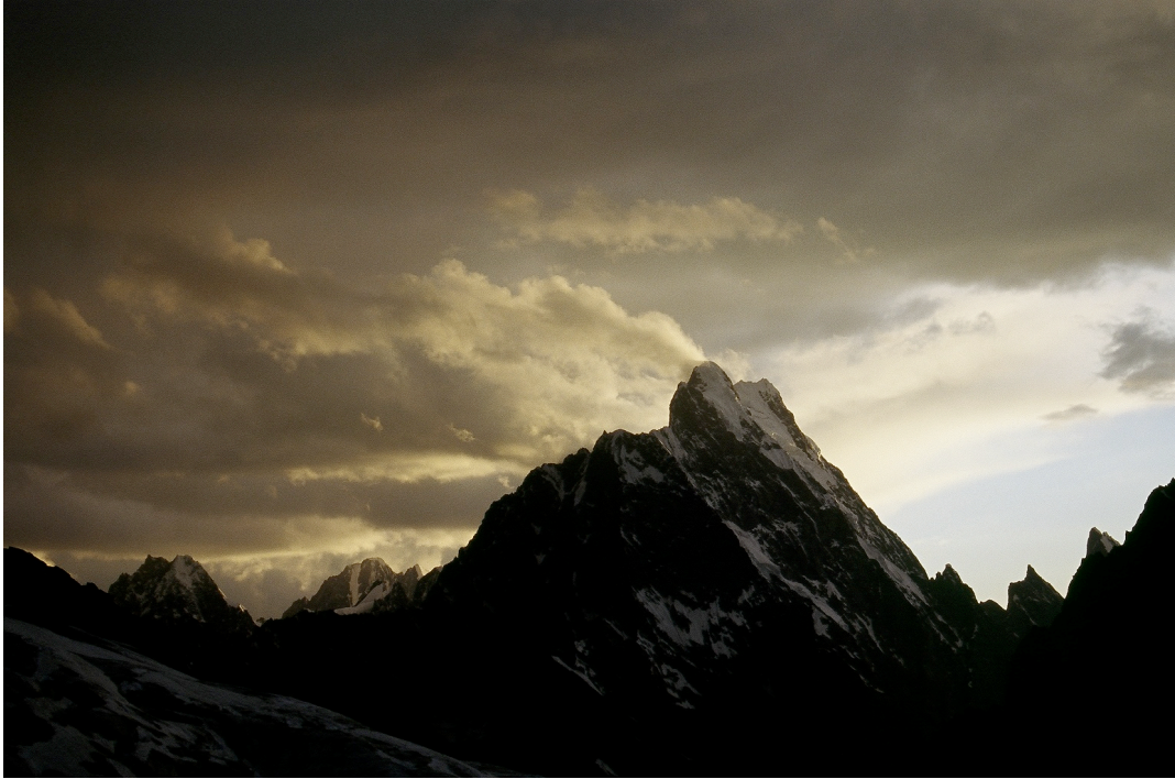
Unknown peak southwest of Dasbar Valley. Seen from the northeast. "Supposedly unclimbed. Quite impressive mountain."