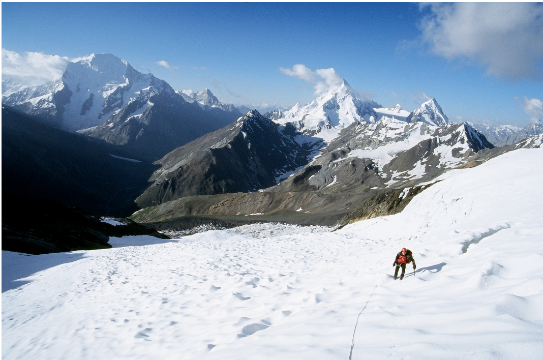
View to the south from Chotar Zom (a.k.a. Dasbar Zom). Ghamubar Chhish on the left ; Kachqiant in center ; Peak 5,900m to Kachqiant's right.