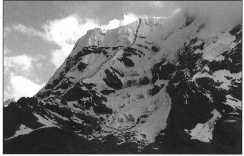
The line to the crest of Huantsan's south ridge, from where Buhler, Callado, and Sole headed west over the twin summits of Nevado Rurec. Carlos Buhler

Nevado Rurec, traverse. From June 8 to 10 two Spaniards, Eloi Callado and Joan Sole, and I traversed the twin summits of Nevado Rurec (5,696m) from the east. We originally wanted to climb the south side of Huantsan from a base camp beneath the southeast face, which we approached from Chavin in two days with burros. Our climb went up the east face of Huantsan's south ridge to its crest at ca 5,600m, where we bivied. Then, however, rather than continuing up Huantsan, we headed west over the summits of Rurec and descended north into the Quebrada Rajucolta, then went on to Huaraz. Our cook brought our gear, with arrieros , from our base camp back to Chavin and then Huaraz. I don't think anyone had traversed Nevado Rurec from east to west before. It wasn't so much a spectacular route, but more of an extended alpine traverse.