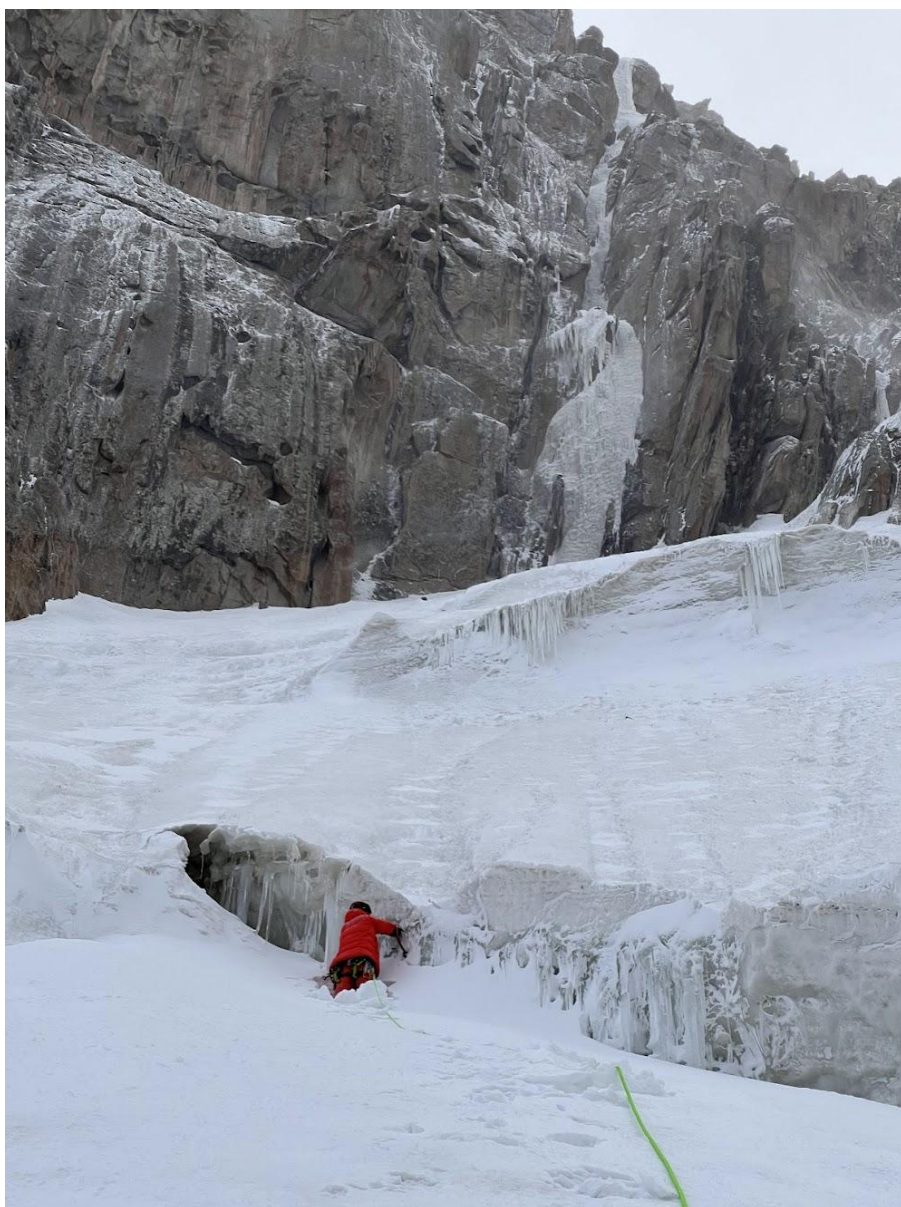
Maxim on the lower ice slopes. Our ice runnel is clearly visible