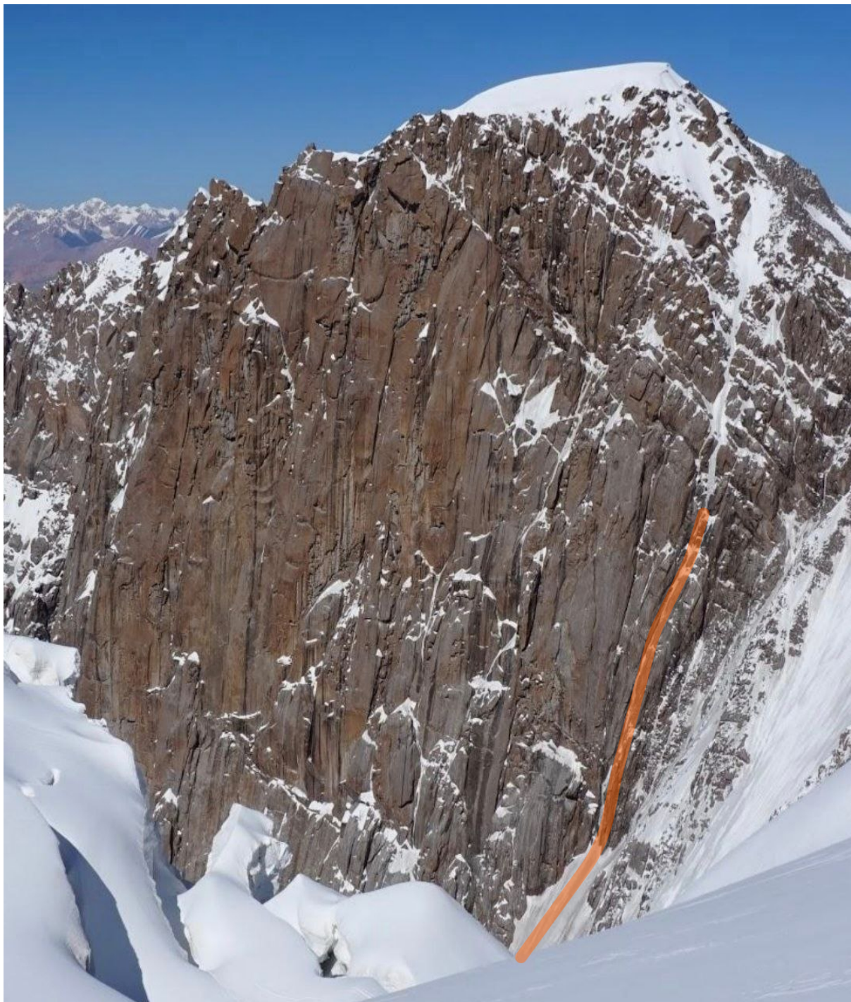
Our high point on Verniy's west face