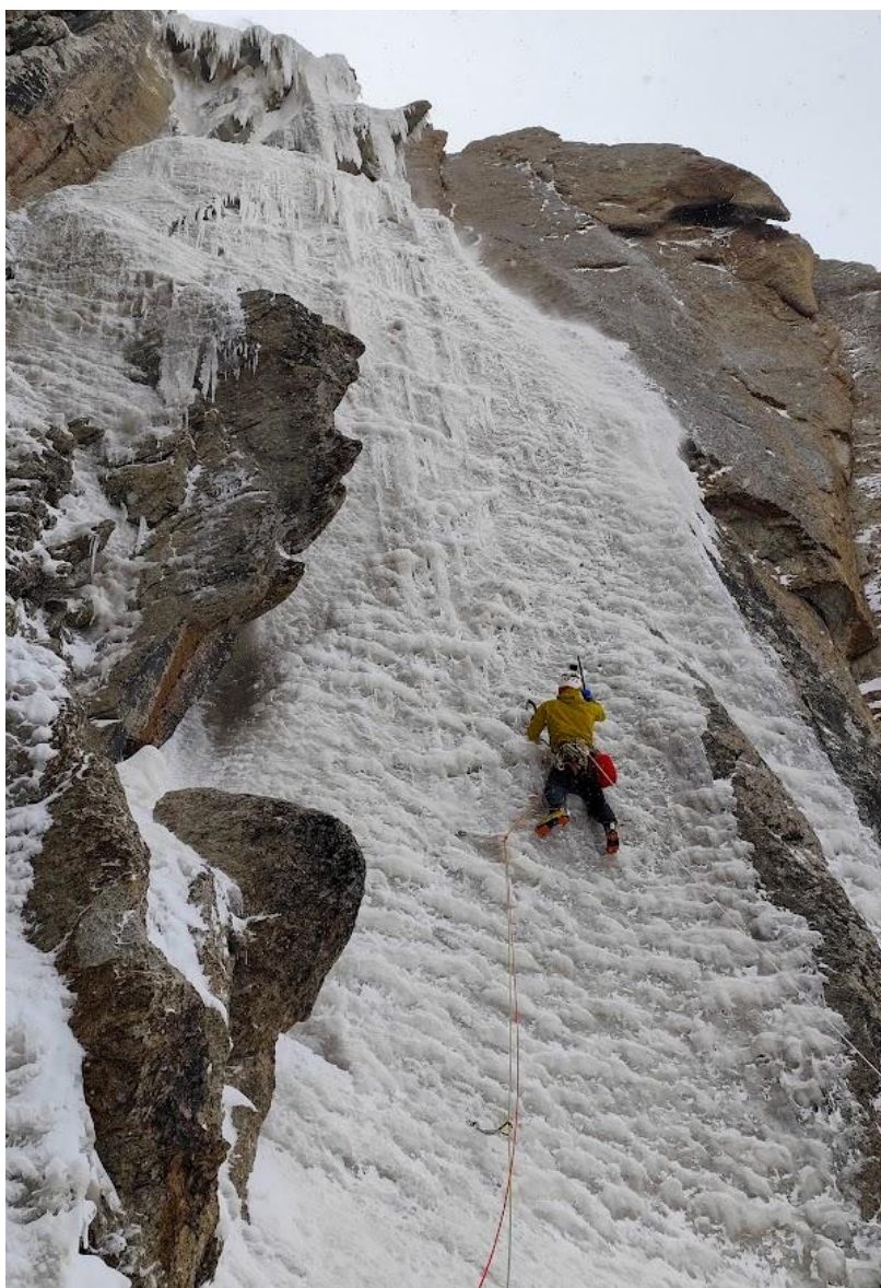
Grigoriy on the first steep pitch