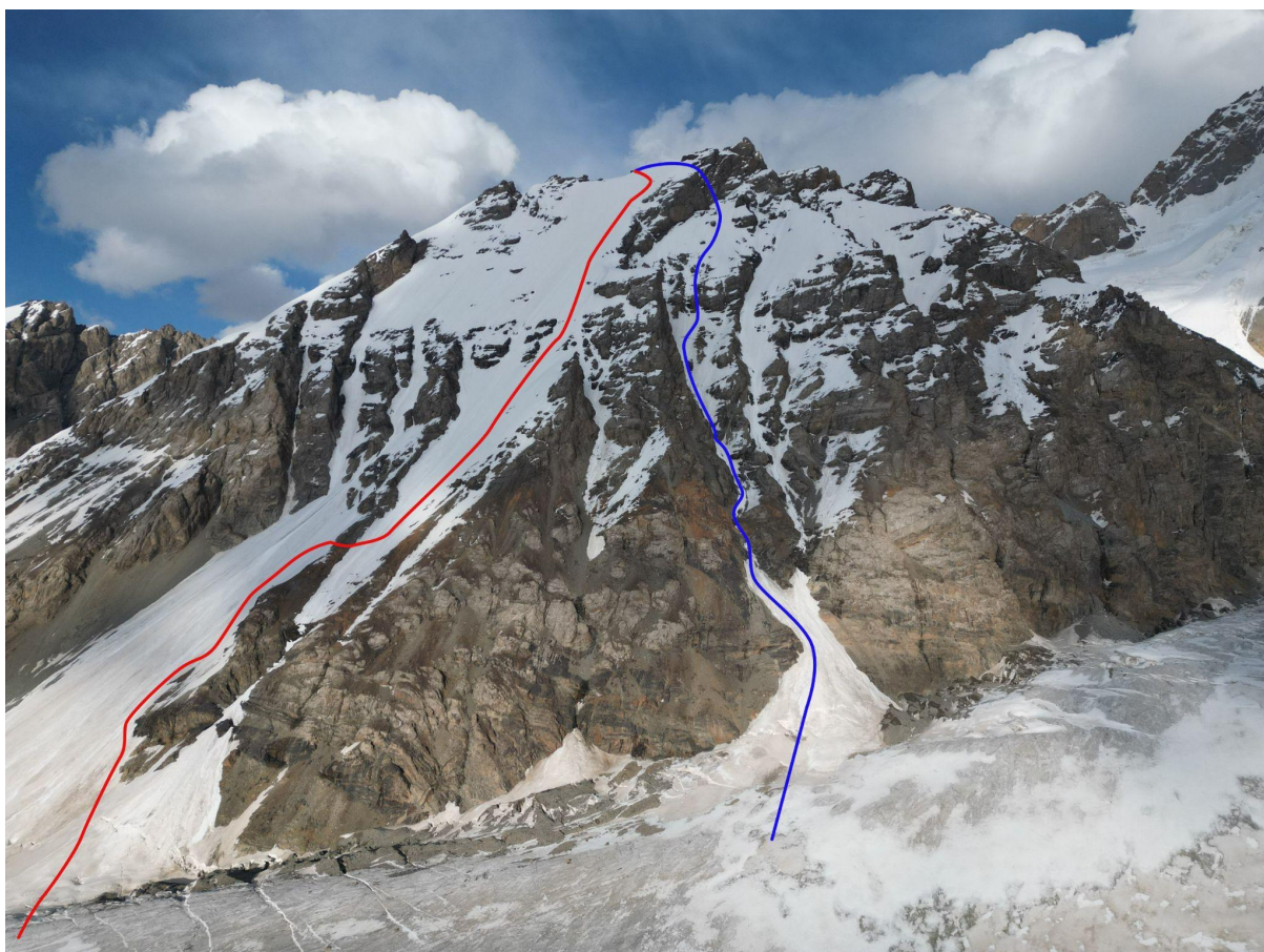
West face of Obzorniy peak. Blue line is Maxim's ascent line, AD+(D) Red is the ski descent line, D, 5.1, E2, 50°/660m