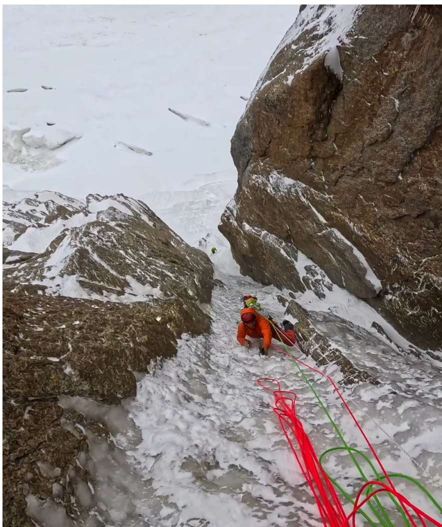
Maxim climbing the second steep pitch. Evgenii on the anchor at the little snow ridge in the background.