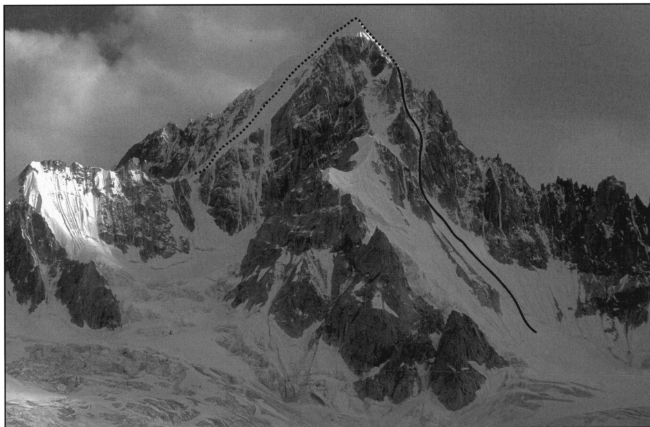
The northwest face of Chola Shan I. Solid line indicates ascent route. Dotted line indicates hidden finish to summit and descent.

Traveling by local buses, we arrived in the town of Dege in early August. Here we stocked