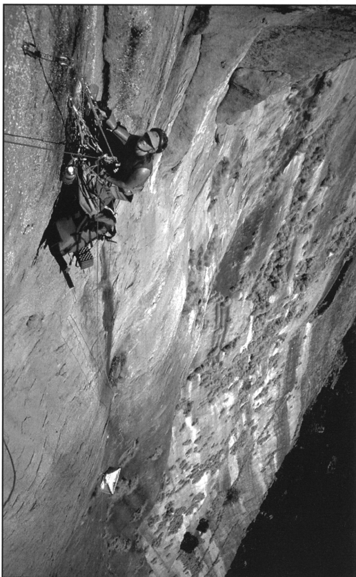
Nancy Feagin on pitch 7, Bravo Les Filles. KATH PYKE

As it turned out, we finished equipping the route with only one day left before leaving the Tsaronoro area. Up to that point, I had free climbed every pitch of the route except pitch 8. On the last day, Nancy and I rappelled down to pitch 8 and I began the process of working out a complicated sequence of moves. This pitch starts out on thin face holds, then follows up a finger crack until the crack peters out into a steep, shallow groove. After