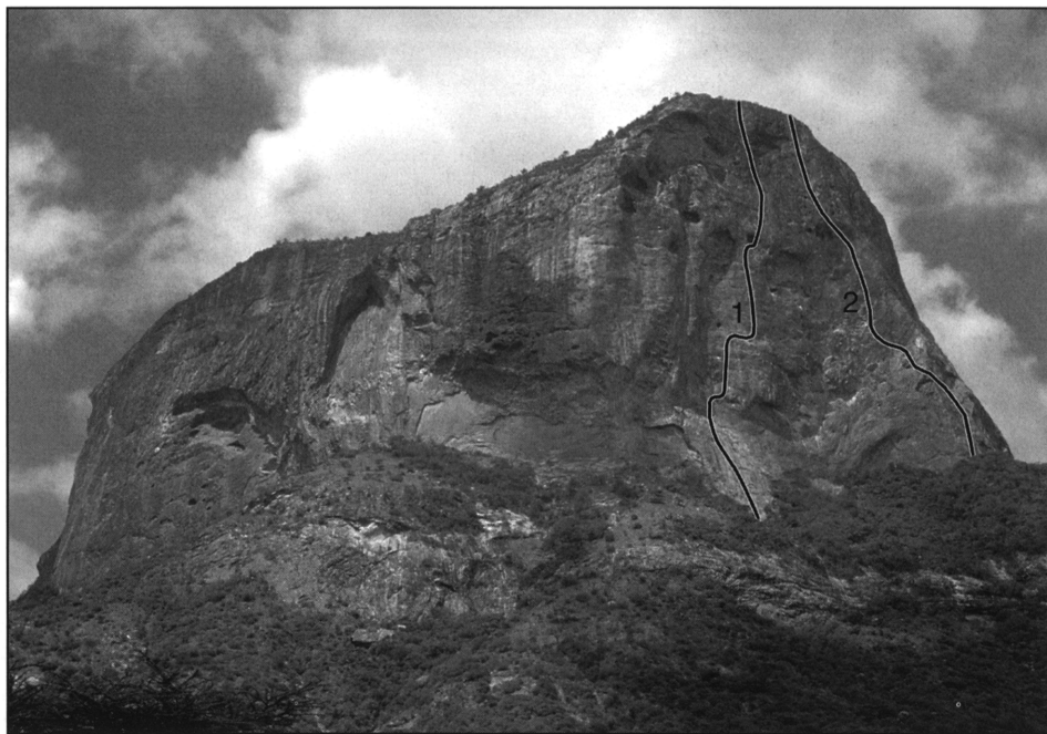
The south and east faces of Poi, showing 1. True At First Light (Bechtel-Milton-Piana-Skinner, 1999). 2. East Face (Corkhill-Wielochowski, 1983). PAUL PIANA

Mali or Madagascar. On the Dark Safari route, we took no pegs or bolts.