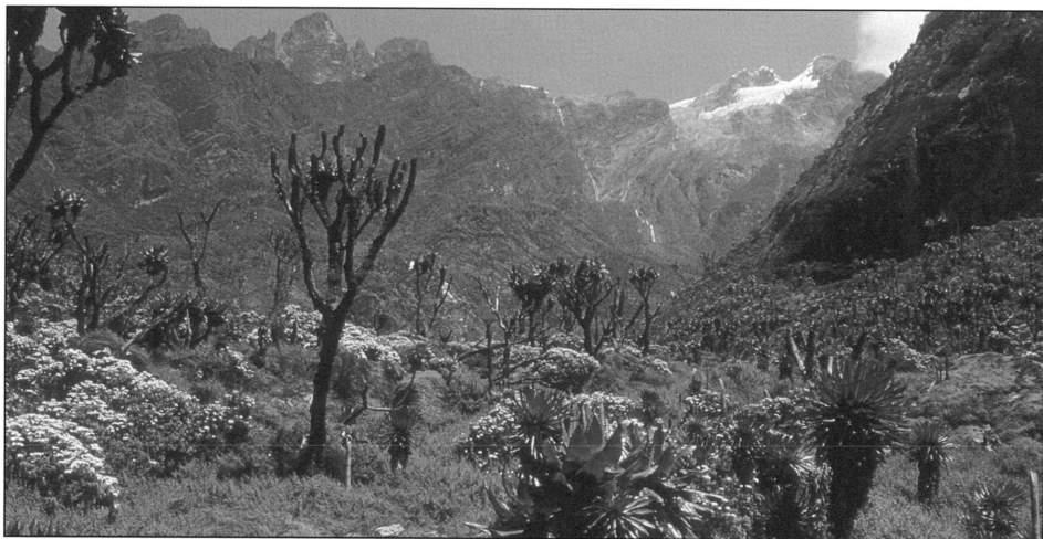
Approaching Bujuku Lake, with the southern peaks of Mt. Stanley on the left and the northern peaks of Mt. Stanley on the right (Alexandra and Margherita). Ralph Baldwin

Rwenzori (Ruwenzori) Mountains, Mountains of the Moon, an historical overview and recent ascent of Mt. Stanley (Margherita Peak, 5,109m.). Rwenzori Mountains National Park is located on the border between Uganda and Zaire. It contains six major glaciated massifs of over 4,600m less