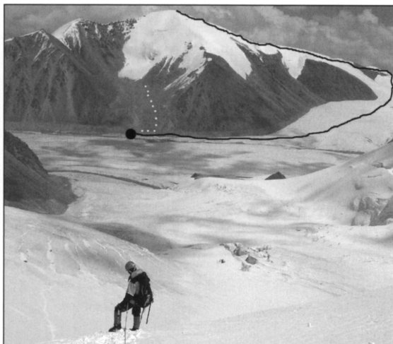
Ong Teng Cheong Peak (4,743m), named after the late president of Singapore.