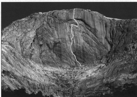
Flakes of Wrath, El Escudo. Cullen Kirk

of the two existing routes we scrambled 500m up a fourth- and easy fifth-class ramp to the left. We climbed along the right side of the central flake feature and crossed over Icaro y La Luna on pitch five, before passing between the two prominent roofs at the top of the formation. The crux pitch required seven protection bolts along a seam and thin smears in a corner. We equipped the route over four climbing days, with a complete ascent on the last day.