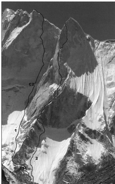
The northeast faces of Meru South (6,660m, left) and Meru Central (6,310m). (1) The new Korean route, Gate to the Sky, which reached the most northerly top of Meru South. The highest summit is generally accepted to be at the southern end of the ridge. (C2) The campsite below the headwall (the latter seen in profile on p. 364 AAJ 2007). (2) The American attempt on the east pillar: the Shark's Fin. Their high point was the best to date on this most coveted objective.

The three climbers reached the ridge just below and right of the most northerly of the points that make up the near-horizontal summit crest of Meru South. [Editor's Note: their GPS read 6,660m, the same as the official height of Meru South. However, it seems generally accepted that the main summit of Meru South is at the southern end of the ridge, reached by Japanese in 1980 during the only ascent of the mountain to date. Photographic evidence would seem