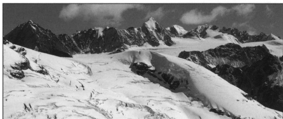
Eastern Kangri Garpo seen from 5,050m on Ata Glacier. On left is KG 27 (ca 5,850m), while fine pointed peak is KG 26 (ca 6,000m). Behind it and to right is Gheni (6,150m). Tatsuo Inoue

days. In contrast our expedition experienced a maximum of only 10cm on the glacier, which was quickly melted by strong sunshine. Although we had only two perfect days and over 20 snowy ones, no snow accumulated on the glacier. This had its good and bad points: glacier travel was relatively easy, but higher, where temperatures remained lower, deep snow on the