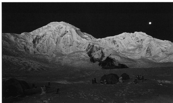
Lopchin (KG II, 6,805m, left) and KG III (6,726m) seen from Camp 1 on Ata Glacier at 4,890m. Moon is setting behind unclimbed KG III. Route on first ascent of Lopchin took left skyline. Tatsuo Inoue

It was obvious there had been little snowfall during the summer and early autumn, which was unusual. Trekkers and climbers who have visited the region in October and November report heavy snowfall and frequent avalanches. The Kobe University attempts on Ruoni in 2003 ( AAJ 2004 ) and 2007 ( AAJ 2008 ) were defeated by bad weather and excessive snow. These expeditions reported 40-50cm of fresh snow each night for periods of three or four